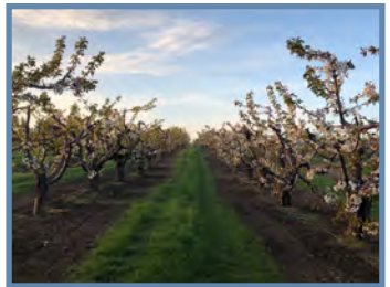
Apples, cherries and pears grow in Green Bluff orchards.