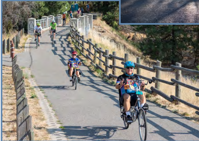
Cycling on the Centennial Trail in Spokane Valley.