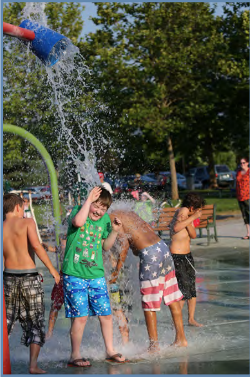
Fourth of July celebration in Liberty Lake.