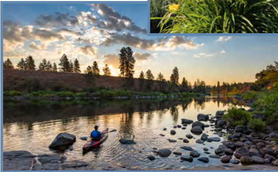
Kayaking on the Spokane River.