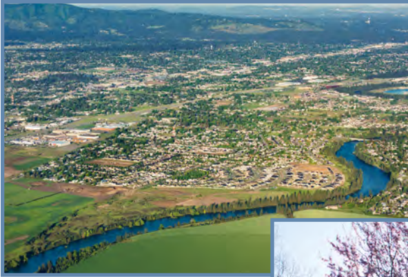
The Spokane River winds through the city of Spokane Valley.

The 4th Legislative District, encompassing the Spokane Valley, Mt. Spokane and surrounding areas, is home to more than 150,000 people. This is where we live and work—a fast-growing community with a thriving economy and outstanding recreational opportunities.