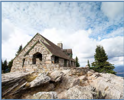
The Vista House at Mt. Spokane State Park.