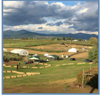
From the highlands of Green Bluff, a sweeping view of the mountains to the east. Community celebrations during the growing and harvest seasons draw tourists from throughout the region.