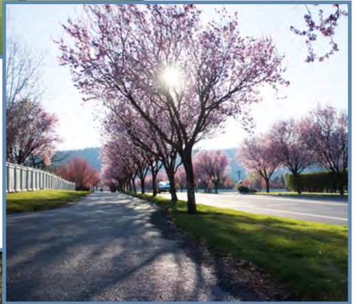
A tree-lined street in the city of Liberty Lake.