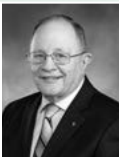
Senator Mike Padden